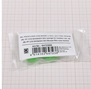
JBL PF CO2 BIO REAKTOR filter