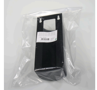
JBL PF CO2 BIO THERMAL CASING