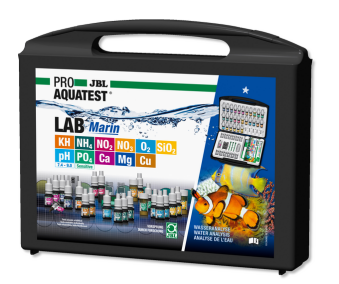
JBL PROAQUATEST LAB Marin

Test case for water analysis in plant aquariums