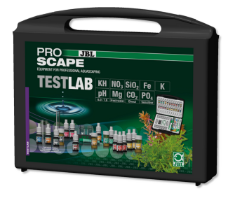
JBL PROAQUATEST LAB PROSCAPE

Test case for water analysis in plant aquariums