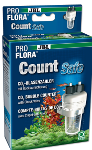
JBL PROFLORA CO2 Count Safe Bubble counter with backflow stop