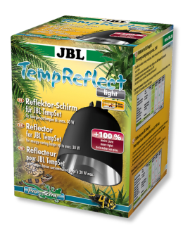
JBL TempReflect light Reflector screen for energysaving lamps