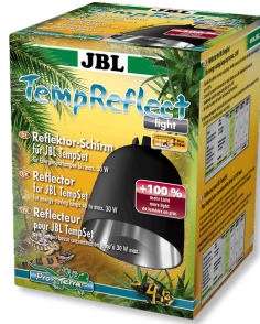
JBL TempReflect light Reflector screen for energy-saving lamps