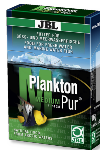
JBL PlanktonPur MEDIUM Treats for large aquarium fish