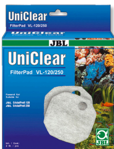
JBL FilterPad VL Cotton fleece for CristalProfi aquarium filters