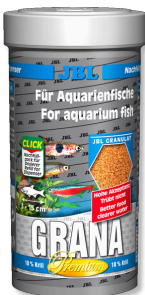
JBL Grana Premium main food granulate for small aquarium fish