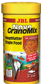
JBL NovoGranoMix Main food for medium-sized and large aquarium fish