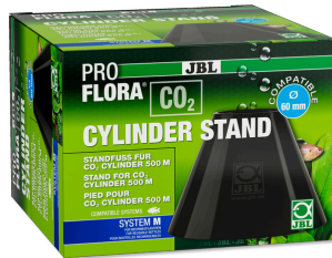
JBL PROFLORA CO2 CYLINDER STAND Stand for 500 g CO2 cylinders