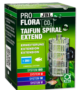
JBL PROFLORA CO2 TAIFUN SPIRAL EXTEND Extension for JBL PROFLORA CO2 TAIFUN SPIRAL 5 / 10