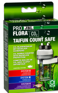
JBL PROFLORA CO2 TAIFUN COUNT SAFE CO2 bubble counter with built-in check valve