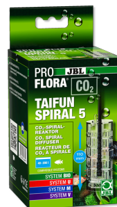
JBL PROFLORA CO2 TAIFUN SPIRAL 5 Expandable CO2 reactor for freshwater aquariums