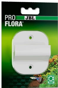
JBL PROFLORA CO2 CYLINDER WALLMOUNT Wall mount for CO2 cylinders with safety bracket