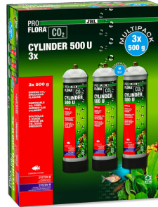
JBL PROFLORA CO2 CYLINDER 500 U 3x 500g disposable CO2 storage cylinder (value pack of 3)