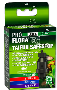
JBL PROFLORA CO2 TAIFUN SAFESTOP Water backflow protection for CO2 systems