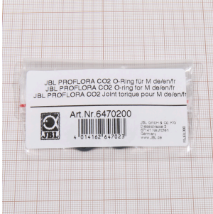
JBL PROFLORA CO2 O- ring for m