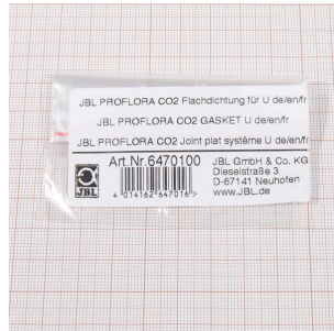
JBL PF CO2 flat gasket for u