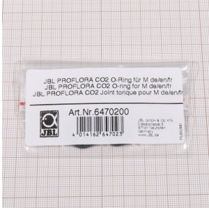
JBL PROFLORA CO2 O- ring for m