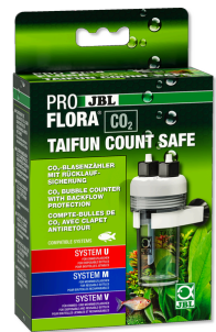
JBL PROFLORA CO2 TAIFUN COUNT SAFE CO2 bubble counter with built-in check valve