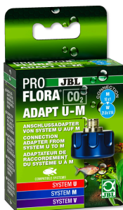
JBL PROFLORA CO2 ADAPT U - M CO2 conversion adapter disposable to refillable bottle