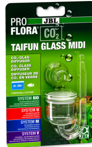
JBL PROFLORA CO2 TAIFUN GLASS Glass CO2 diffuser for freshwater tanks from 40-300 l