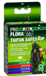
JBL PROFLORA CO2 TAIFUN SAFESTOP Water backflow protection for CO2 systems