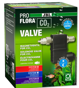
JBL PROFLORA CO2 VALVE CO2 solenoid valve for regulated CO2 addition