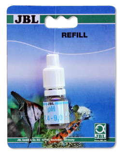
JBL pH Test 7.4-9.0 pH test in aquariums and ponds in the range 7.4-9.0