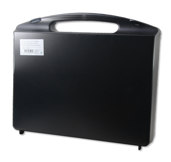
JBL Testlab empty + inserts

JBL assortment Test Colour Charts Colour charts for JBL water