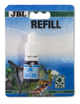
JBL pH Test 3.0-10.0 Quick test to determine the acidity