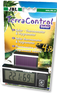
JBL TerraControl Solar Solar-powered thermometer + hygrometer for terrariums