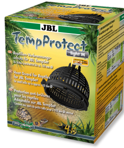
JBL TempProtect light Reptile thermal burn protection for JBL TempSets