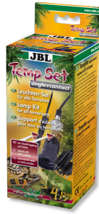
JBL TempSet angle+ connect Installation kit for lamps in terrariums