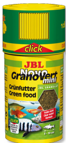
JBL NovoGranoVert mini CLICK

Main food granulate for plant-eating fish