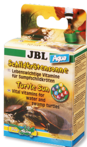
JBL Turtle Sun Aqua Vitamins for turtles and pond terrapins