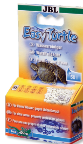
JBL EasyTurtle Special granulate to remove odours