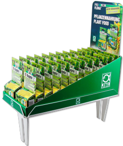
JBL tray 381 x 186 x 30mm