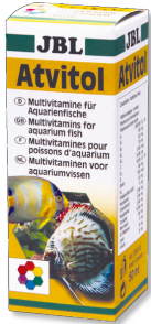
JBL Atvitol Multivitamin drops for aquarium fish