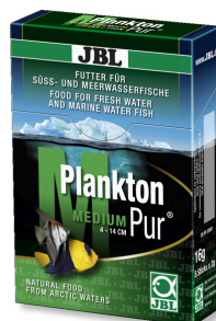
JBL PlanktonPur MEDIUM