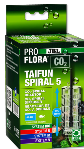
JBL PROFLORA CO2 TAIFUN SPIRAL 5 Expandable CO2 reactor for freshwater aquariums