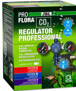
JBL PROFLORA CO2 REGULATOR PROFESSIONAL Pressure regulator with 2 displays & valve for CO2