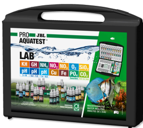
JBL PROAQUATEST LAB Test case with 13 water tests for freshwater analysis