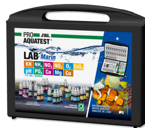
JBL PROAQUATEST LAB Marin Professional test case for marine water analysis