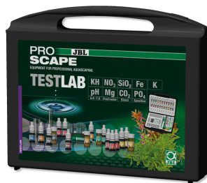
JBL PROAQUATEST LAB PROSCAPE Test case for water analysis in plant aquariums