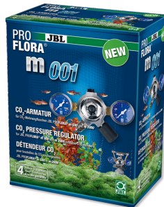
JBL PROFLORA m001

Stand for cylinders of CO2 fertiliser systems