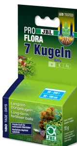
JBL PROFLORA 7 Balls Root fertiliser for freshwater tanks (7 fertil. balls)