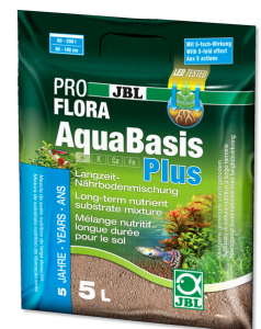
JBL PROFLORA AquaBasis plus Long-lasting nutrient substrate f. freshwater aquarium