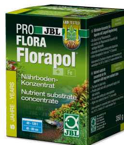
JBL PROFLORA Florapol Long-term nutrient substrate concentrate