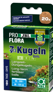
JBL PROFLORA 7 + 13 Balls Root fertiliser for freshwater aquariums