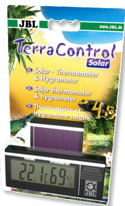
JBL TerraControl Solar Solar-powered thermometer + hygrometer for terrariums