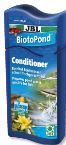
JBL BiotoPond Water conditioner for ponds