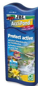
JBL AccliPond Water conditioner for ponds