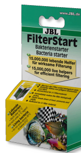
JBL FilterStart Bacteria for the activation of filters