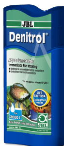
JBL Denitrol Bacteria starter for adding aquarium fish