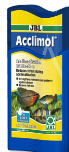
JBL Acclimol Water conditioner for acclimatisation