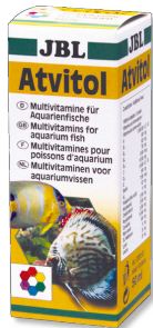
JBL Atvitol Multivitamin drops for aquarium fish