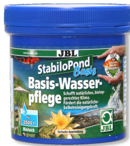
JBL StabliPond Basis Basic care product for all garden ponds