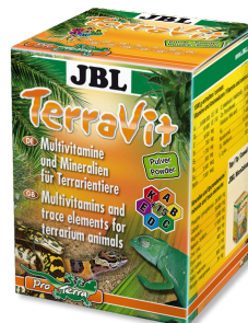
JBL TerraVit Powder Vitamins and trace elements for terrarium animals