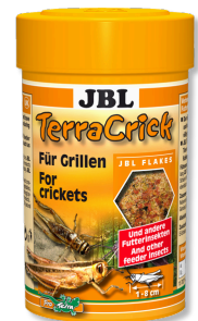
JBL TerraCrick Complete food for feeder insects