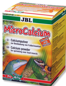
JBL MicroCalcium Mineral supplementary food for all reptiles