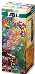
JBL TerraVit fluid Vitamins and trace elements for terrarium animals