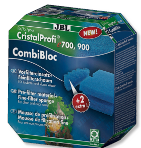
JBL CombiBloc CristalProfi e Pre-filter pads and filter foam for CristalProfi e