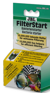
JBL FilterStart Bacteria for the activation of filters