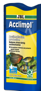
JBL Acclimol Water conditioner for acclimatisation