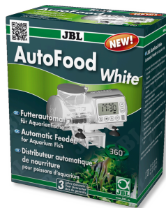
JBL AutoFood WHITE White automatic feeder for aquarium fish