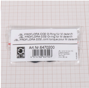
JBL PROFLORA CO2 O- ring for m