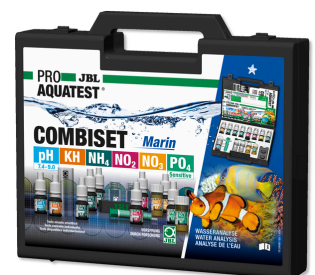
JBL PROAQUATEST COMBISET Marin Test case for water analyses in marine aquariums