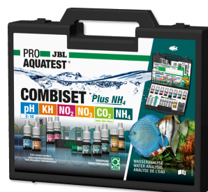
JBL PROAQUATEST COMBISET Plus NH4 Test case with most important water tests + NH4 test