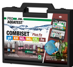
JBL PROAQUATEST COMBISET Plus Fe Test case with most important water tests + iron test