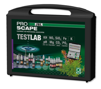
JBL PROAQUATEST LAB PROSCAPE

Test case for water analysis in plant aquariums