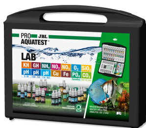
JBL PROAQUATEST LAB Test case with 13 water tests for freshwater analysis