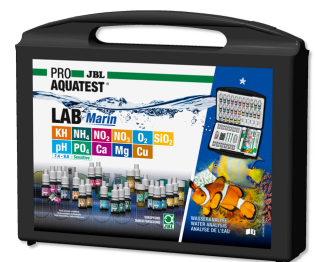
JBL PROAQUATEST LAB Marin Professional test case for marine water analysis