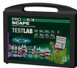
JBL PROAQUATEST LAB PROSCAPE Test case for water analysis in plant aquariums