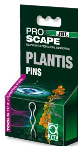
JBL PROSCAPE PLANTIS PINS Plant pegs for the anchoring of aquarium plants