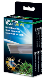
JBL LED SOLAR Hanging

Rope hanging fixture for JBL LED SOLAR lights