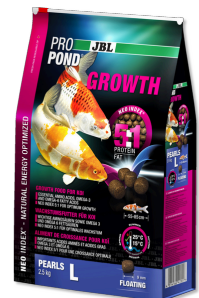
JBL PROPOND GROWTH L