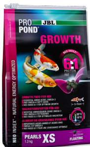
JBL PROPOND GROWTH XS