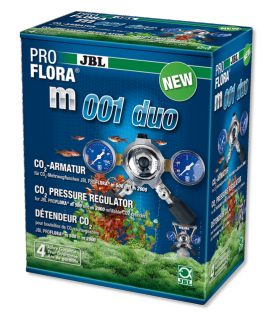
JBL PROFLORA m001 duo Fitting to reduce pressure for 2 CO2 diffusers