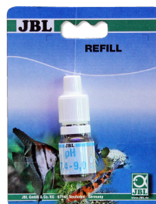
JBL pH Test 7.4-9.0 pH test in aquariums and ponds in the range 7.4-9.0