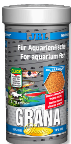
JBL Grana Premium main food granulate for small aquarium fish