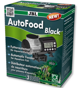
JBL AutoFood BLACK Black automatic feeder for aquarium fish