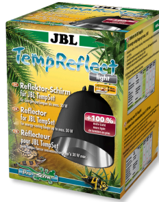
JBL TempReflect light Reflector screen for energy- saving lamps