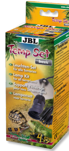
JBL TempSet basic Installation kit for lamps in terrariums