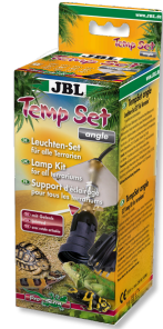
JBL TempSet angle Installation kit for lamps in terrariums