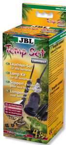
JBL TempSet connect Installation kit with connector