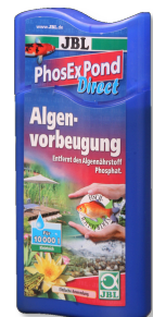
JBL PhosEX Pond Direct Phosphate remover for ponds