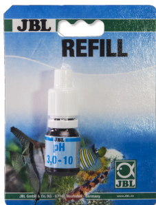
JBL pH Test 3.0-10.0 Quick test to determine the acidity