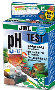
JBL pH Test 6.0-7.6 pH test for freshwater aquariums in the range 6.0-7.6