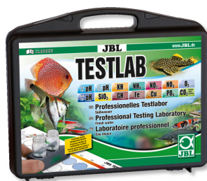
JBL Testlab Test case with 13 tests f. freshwater analysis Testlab