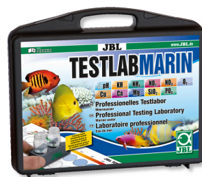
JBL Testlab Marin Professional test case for the analysis of saltwater