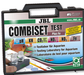
JBL Test Combi Set plus Fe Test case with most important water tests + iron test